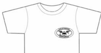
Bulldog Face Design